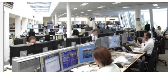
Example: Nord LB, Hannover