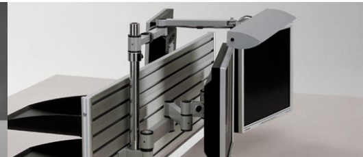
Light Top with swivel arm

Light-Top | The unique illumination for monitor workstations. The light is concentrated onto the working surface. There are no irritating effects such as mirroring or light reflections on the screens. Greater comfort and better concentration – Light-Top creates the ideal working conditions. The distribution of light on the working surface and the brightness can be adjusted individually.