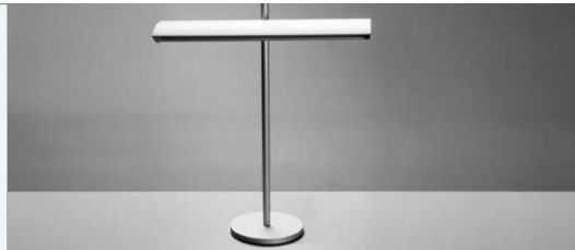
Light-Top as a table lamp